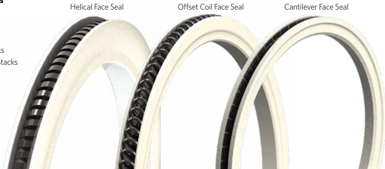
Helical Face Seal