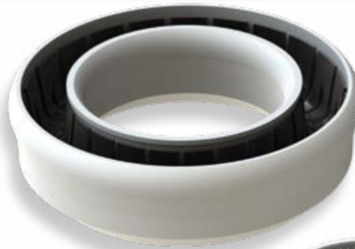
Cantilever Spring Seal